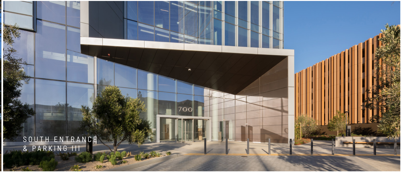
SOUTH ENTRANCE & PARKING III