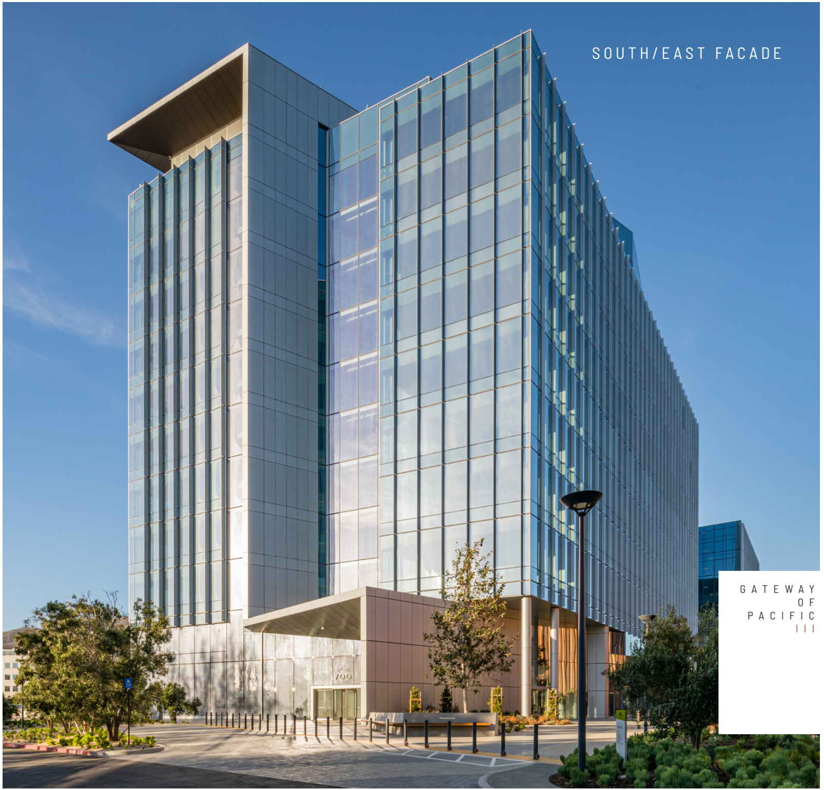
GATEWAY OF PACIFIC