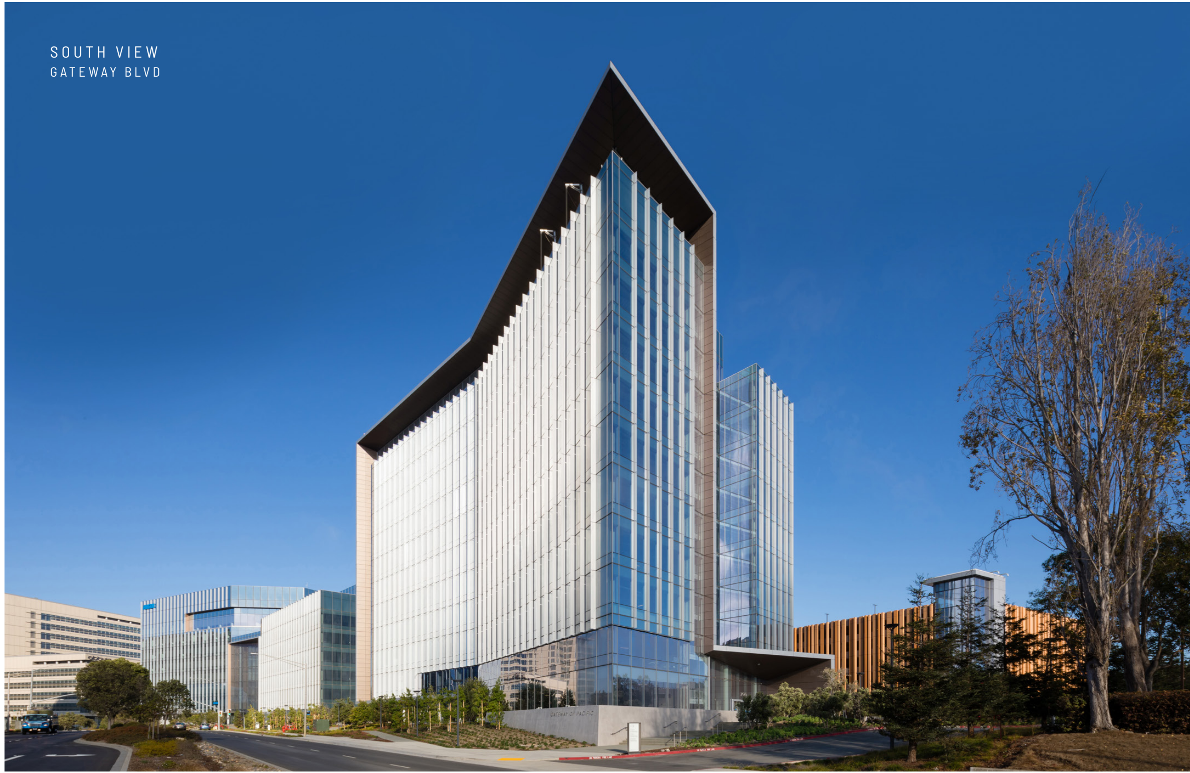
SOUTH VIEW GATEWAY BLVD