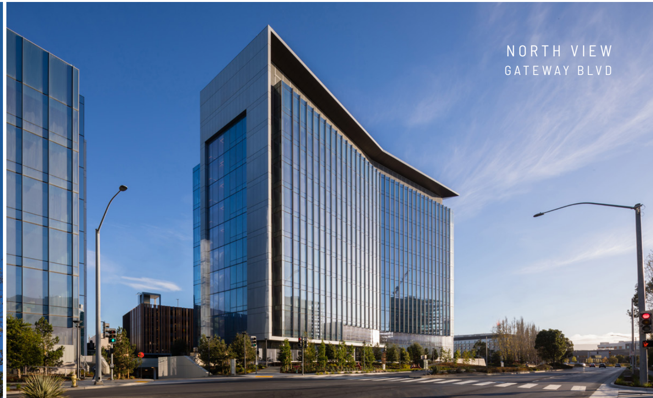
NORTH VIEW GATEWAY BLVD